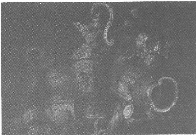
37. Pots and Flowers. Painting by M. Contes